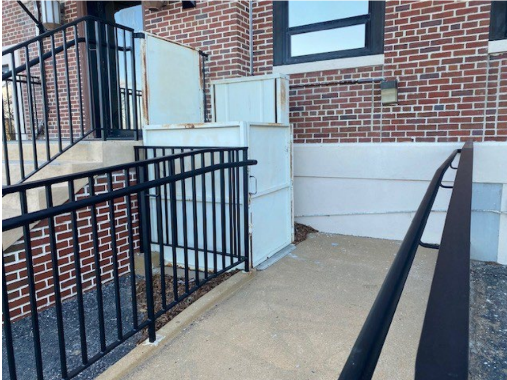
Figure 1 - F.558 Handicap Elevator